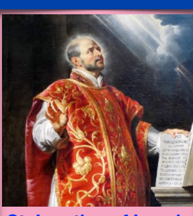
St. Ignatius of Loyola By : Joseph Jeffy