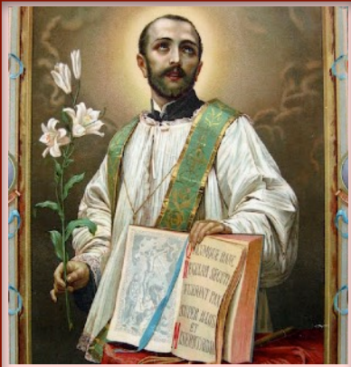
St. Anthony Zaccaria