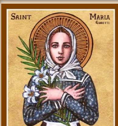
St. Maria Goretti