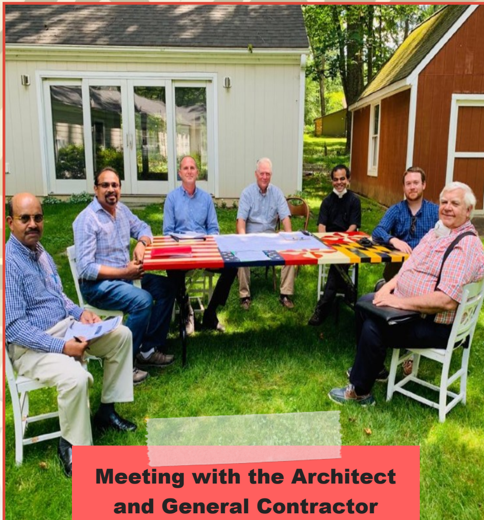
Meeting with the Architect and General Contractor