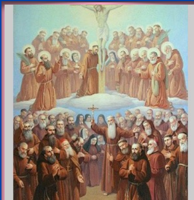
Bl. Emmanuel Ruiz