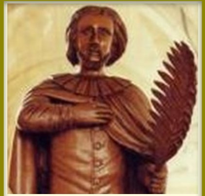
Bl. Ralph Milner