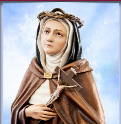
St. Veronica Giuliani