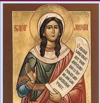
Blessed Jutta of Thuringia