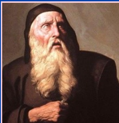
Blessed Raymond Lull