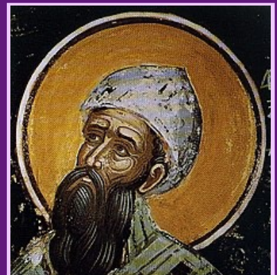
St. Cyril of Alexandria