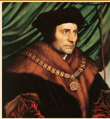
St. Thomas More