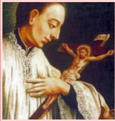
St. Aloysius Gonzaga